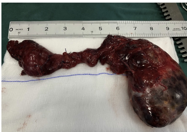
Fig. 4. showing the size of the thyroid gland (in inches) after being completely removed.

5 days. Follow up done for 2 months with no reported complications and the patient received thyroid replacement therapy.