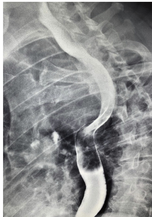
Fig. 2. Barium study showing the deviation of the esophagus by the large thyroid gland.

The patient had uneventful recovery with no voice changes and the 4-h postoperative serum parathyroid hormone level and serum calcium were with normal values. The patient discharged after 3 days and 2 low pressure suction drains remained in place for